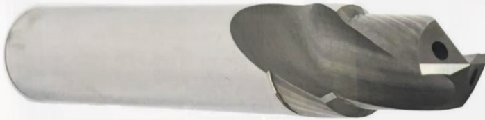
2 FLUTE COOLANT FEED STEP DRILL