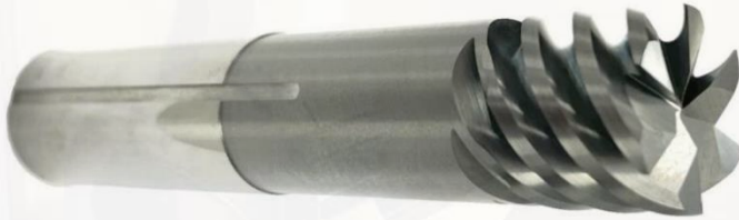
6 FLUTE HIGH PERFORMANCE ENDMILL