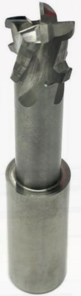
4 FLUTE PROFILE CUTTER