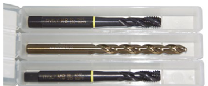
HSSE5 DRILL DIN 338 SPLIT POINT REF: 550